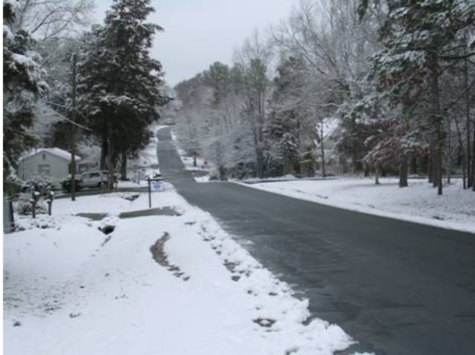
Figure 2: A local road in Wake County, NC following a moderate snowstorm. Note the accumulation of snow on trees and non-paved surfaces, while the warmer asphalt has prevented any accumulation.

In general, both major and local roadways are severely impacted when the temperature drops significantly, rendering pre-treatment solution and salt ineffective, and when the accumulation rate is greater than the rate of clearing from plowing. Following an event, cold temperatures can cause melt-water on the roads to re-freeze (i.e., “black ice”) while road surfaces can be damaged from plow scrapes and numerous freeze-thaw cycles. In contrast, impacts to transportation are often minimized during early and late season events when paved surfaces are able to warm sufficiently to prevent accumulation of winter precipitation (Fig. 2).