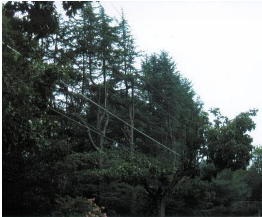
Figure 3: Example of aggressive tree-trimming around power lines in Forsyth County, NC.

of the crash. The most commonly cited causes were skidding on a slick road and striking another car or object (in most cases it was the passenger who was killed), skidding off a bridge, head-on-collision due to an inoperable traffic light, and individuals struck while standing next to a disabled vehicle. Approximately 29% of reported deaths were classified as “indirect” and included smoke inhalation and burns due to house fires, carbon monoxide poisoning, and respiratory distress. In addition, two young boys drowned while walking across an ice-covered pond in the RDU area. The remaining deaths were due hypothermia and exposure. All of these victims were at least 60 years of age and two were homeless.