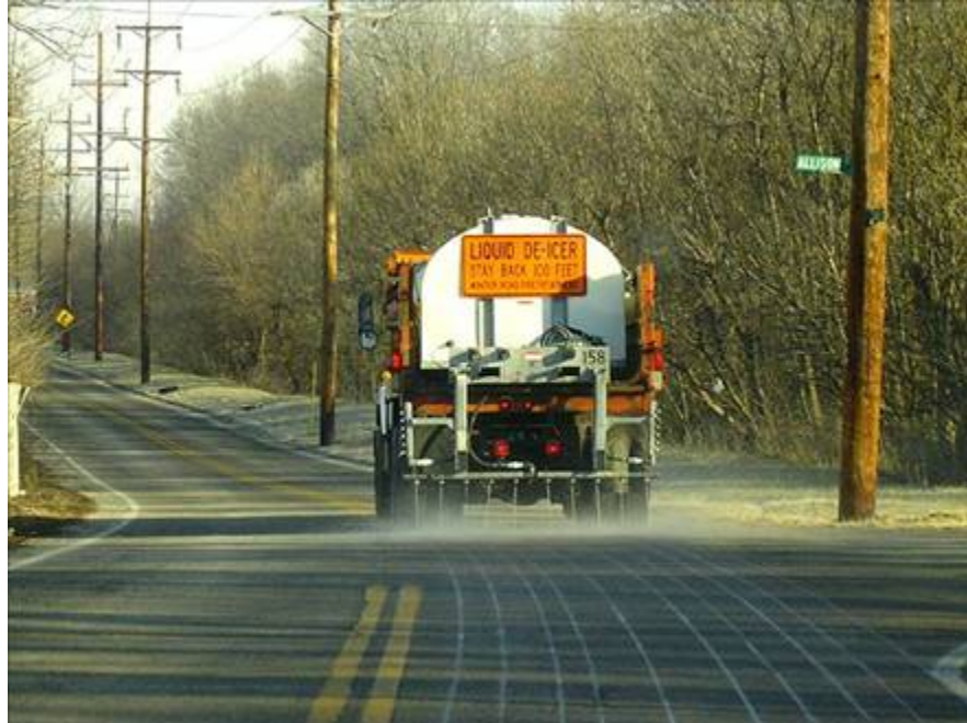
Figure 4: Department of Transportation truck sprays calcium chloride on an arterial road in Wake County, NC prior to an impending winter storm.